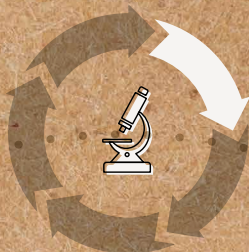
fig. 1 Genetic Seed Breeding Research and development into new potato varieties and more