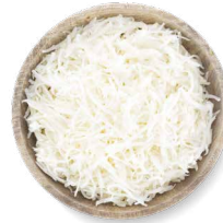
COHN FARMS SHREDDED POTATOES

Colour: Red skin, White or off-white flesh Ways to Prepare: Boil or roast Size: 38-57mm Available in: 50lb box Product of Canada