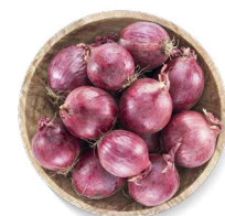
COHN FARMS RED ONIONS

Processing: Peeled Available in: 22lb bag