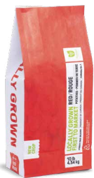
FANCY PAK BRAND NEW CROP RED NO. 1

Colour: Yellow skin & flesh Ways to Prepare: Mash or fry Available in: 10lb Compostable & 100% recyclable paper bag Product of Canada