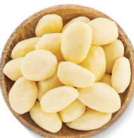
COHN FARMS WHITE WHOLE PEEL POTATOES

Processing: Peeled Available in: 22lb bag • Also available: Colossal & Spanish