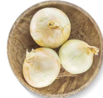
COHN FARMS COOKING ONIONS

Processing: Peeled Available in: 22lb bag