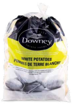
DOWNEY WHITE NO. 1

Colour: White skin & flesh Ways to Prepare: Fry, mash or boil Available in: 20lb Poly bag Product of Canada/USA