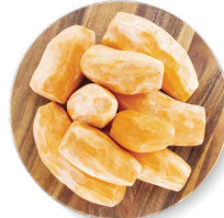
COHN FARMS SWEET POTATOES WHOLE PEEL

Colour: Red skin, White or off-white flesh Ways to Prepare: Boil or roast Size: 19-41mm Available in: 25lb box Product of Canada