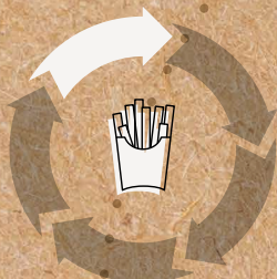
fig. 5 Loss-Preventive Processing "Imperfect" produce is washed, peeled, cut & sold, and waste becomes fertilizer, re-starting the cycle

From creating our own seeds to turning any potato waste into fertilizer for our growing fields, the entire closed-loop process is under our control.