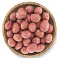
COHN FARMS B SIZE RED POTATOES NO.1

Processing: Peeled Count size: 50 to 110 Available in: Compostable & 100% recyclable paper box Product of Canada