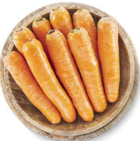
COHN FARMS JUMBO CARROTS

Processing: Whole Available in: 8-10 pack /12 pack