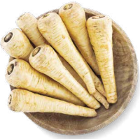
COHN FARMS PARSNIPS

Processing: Whole Available in: 5lb & 25lb bags