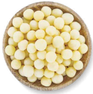
COHN FARMS PARISIENNE POTATOES

Processing: Shredded & double shredded Available in: 22lb bag