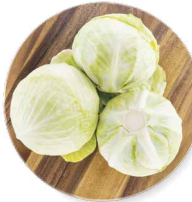
COHN FARMS GREEN CABBAGE

Processing: Whole Available in: 8-10 pack /12 pack