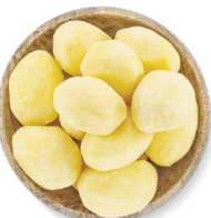
COHN FARMS YUKON WHOLE PEEL POTATOES

Processing: Whole Available in: 10lb box, 25lb & 50lb bags • Also available: Colossal & Spanish