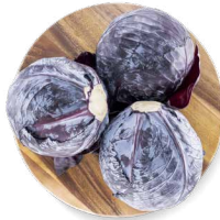
COHN FARMS RED CABBAGE

Processing: Whole Available in: 5lb, 10lb, 25lb & 50lb