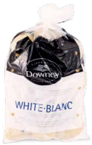
DOWNEY WHITE NO. 1

Colour: White skin & flesh Ways to Prepare: Fry, mash or boil Available in: 20lb Poly bag Product of Canada/USA