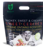
DOWNEY/BISTRO SWEET CERISES NO. 1

Sweet Cerises potatoes are naturally creamy and buttery with a beautiful pink skin and incredibly versatile, too.