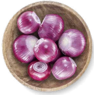
COHN FARMS RED ONIONS

Processing: Peeled Available in: 22lb bag