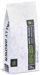
FANCY PAK BRAND NEW CROP WHITE NO. 1

Colour: White skin & flesh Ways to Prepare: Boil or mash Available in: 10lb Compostable & 100% recyclable paper bag Product of Canada