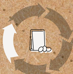
fig. 4 Sustainable Storage & Packing Potatoes sorted, stored and shipped in ways that reduce water usage and emissions