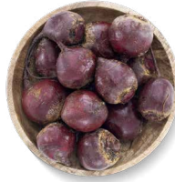
COHN FARMS RED BEETS

Processing: Peeled Available in: 22lb bag