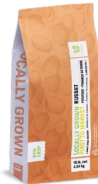
FANCY PAK BRAND NEW CROP RUSSET NO. 1

Colour: Red skin, White or off-white flesh Ways to Prepare: Mash or roast Available in: 10lb Compostable & 100% recyclable paper bag Product of Canada