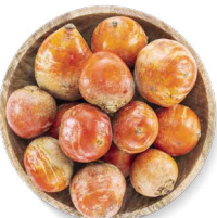
COHN FARMS GOLD BEETS

Processing: Peeled Available in: 22lb bag