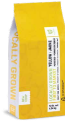
FANCY PAK BRAND NEW CROP YELLOW NO. 1

Colour: White skin & flesh Ways to Prepare: Boil or mash Available in: 10lb Compostable & 100% recyclable paper bag Product of Canada