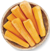
COHN FARMS JUMBO CARROTS

Processing: Whole Available in: 8-10 pack /12 pack