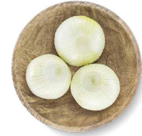
COHN FARMS COOKING ONIONS

Processing: Peeled Available in: 22lb bag