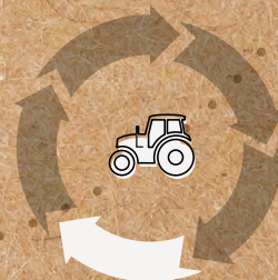
fig. 3 Regenerative Farming Regenerative farming practices that maintain soil health, including crop rotation