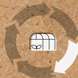
fig. 2 Potato Seed Growing Growing several varieties of disease-free, high-growth seed potatoes

From creating our own seeds to turning any potato waste into fertilizer for our growing fields, the entire closed-loop process is under our control.