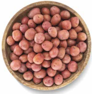
COHN FARMS RED CREAMERS NO.1

Colour: Red skin, White or off-white flesh Ways to Prepare: Boil or roast Size: 19-41mm Available in: 25lb box Product of Canada